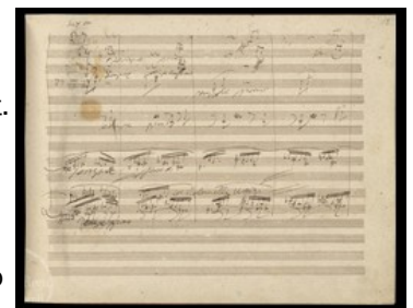
A page from Beethoven's Ninth Symphony