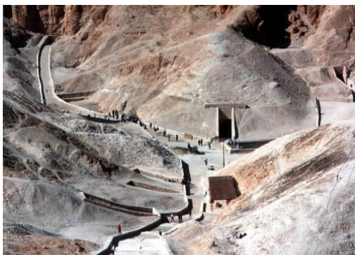
Valley of the Kings

One of the most interesting things in the tomb was a note on the handle of the king's fan . The note showed that the young Tutankhamun hunted at Heliopolis, near modern Cairo. Wine-jar labels showed how long he was pharaoh . Many objects had scenes that show Tutankhamun killing foreign enemies in battle . But historians don't think that these scenes show real events.