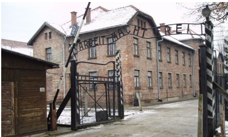
Entrance at Auschwitz

The Nazis decided that they had to solve what they called "the Jewish problem" once and for all . On January 20, 1942 the Nazi leaders met at the Wannsee Conference near Berlin and decided that all Jews should be killed.