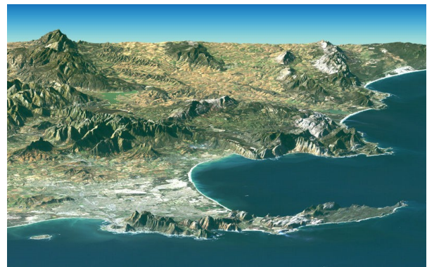
Location of Cape Town

Cape Town is South Africa’s oldest and second largest city. Founded as a Dutch trading station it was the biggest town until gold was found. Cape Town is known for its famous landmarks . Durban, on the east coast, is South Africa’s main port and a major industrial centre. Most of the country’s Asian people live here.