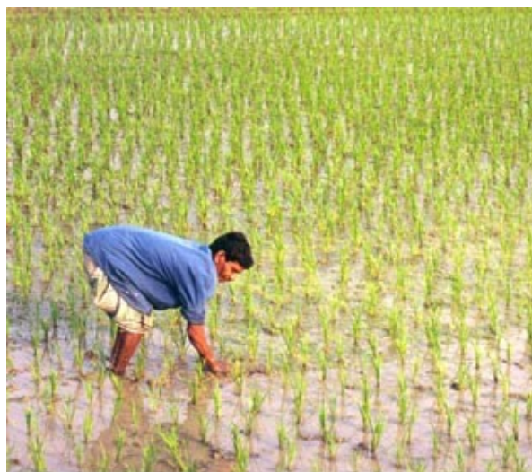
Rice planter in Bangladesh

Other countries, like the USA, produce rice for export.