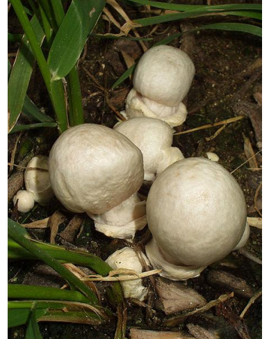
The destroying angel

It is often very hard for people to tell between edible and poisonous mushrooms. So, never eat a mushroom you find unless you know what it is.