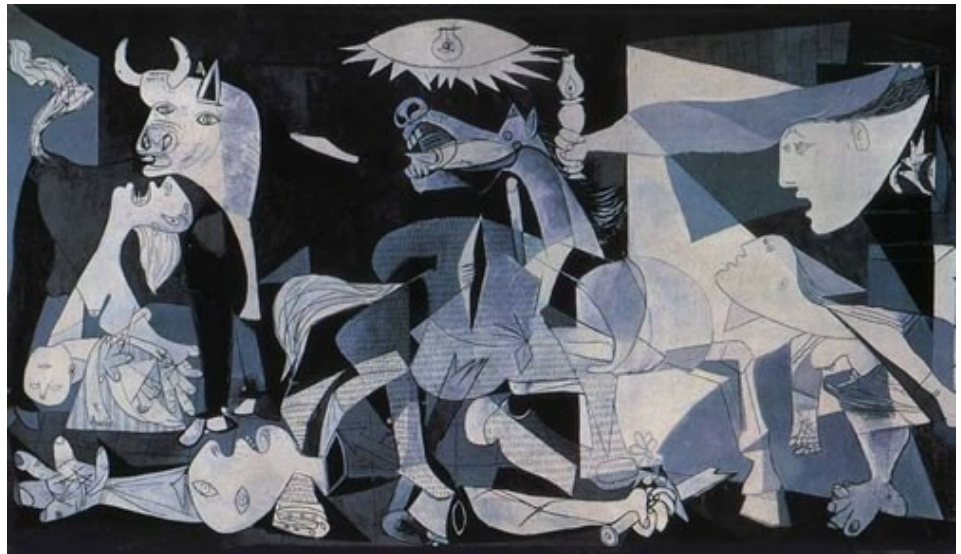
Guernica , 1936

In 1936 Civil War broke out in Spain. During this period he painted his masterpiece Guernica . It shows the terrified people of the ancient Spanish town which was bombed during the Civil War . Picasso was shocked by this inhuman act and in his painting he shows people running in the streets and screaming with their mouths wide open. To display his sadness and anger he used only black and white as well as shades of grey.